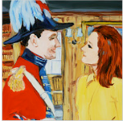
Scattered Stories, Shaken and Stirred