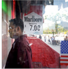
Immigration Law Change Could Reshape New York