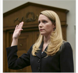
Buchanan: Chain Reaction Corruption