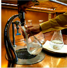
A Few Restaurants Tilt to Tap Water